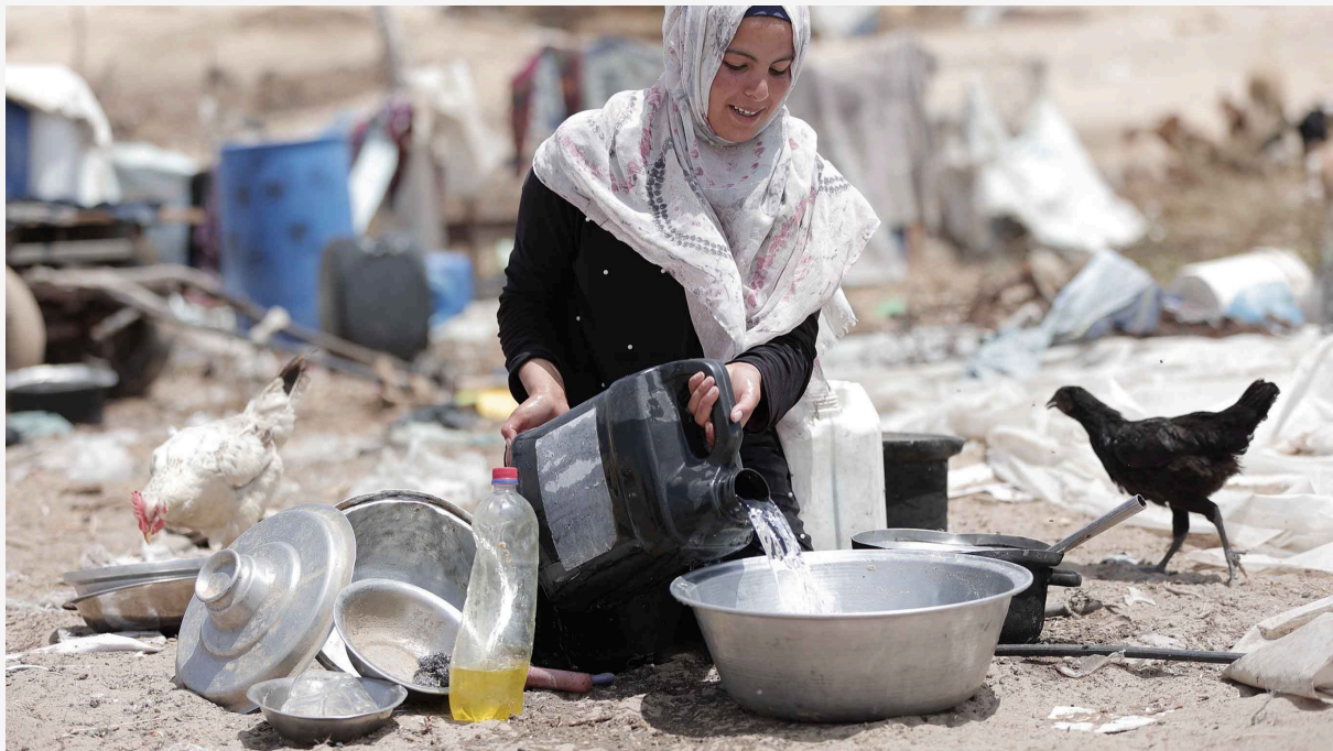
Gaza, November 2024.

“Let us then pursue what makes for peace”